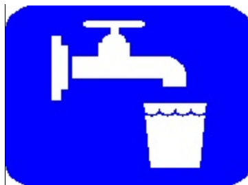
AND GROUNDWATER SUPPLY

Adopted July 7, 1997 - Revised June 23, 2007